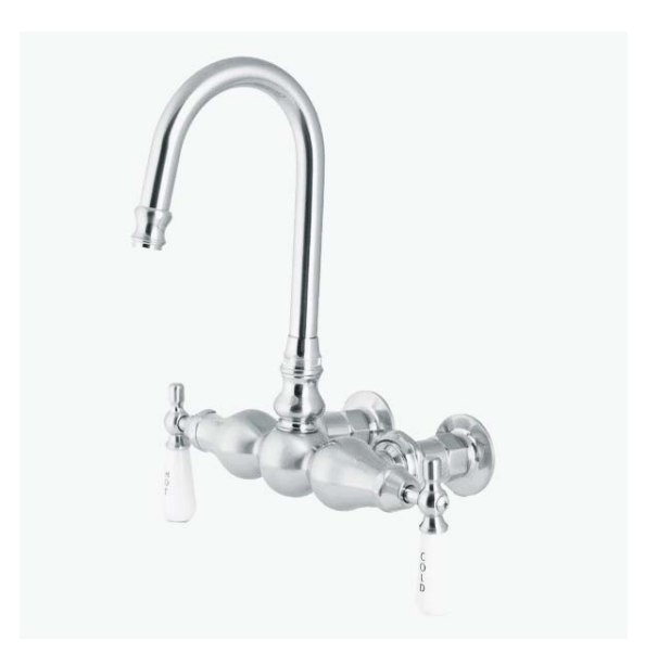
Wall Mount Goose Neck Faucet

RS-14901 / Chrome RS-14903 / Polished Brass RS-14904 / Brushed Nickel RS-14905 / Polished Nickel