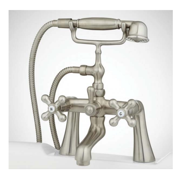
Deck Mount British Telephone Faucet

CLT-3201 / Chrome CLT-3204 / Brushed Nickel