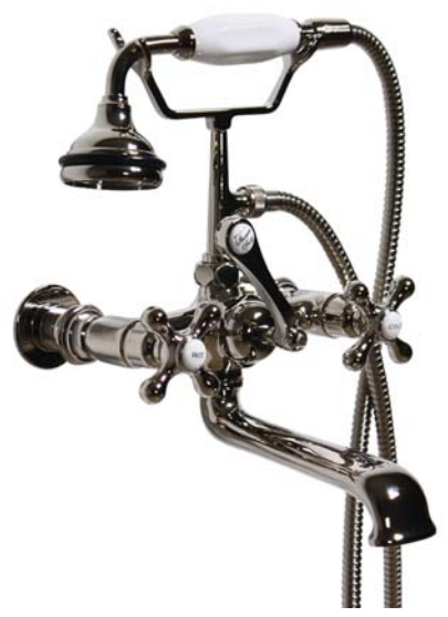
Wall Mount British Telephone Faucet with 6" wall extension