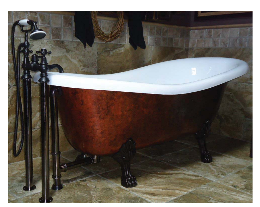
Right: SL670-PBOB 67" Cast Iron Slipper tub with Custom Oil Rubbed Bronze exterior finish and Oil Rubbed Bronze Paw Feet