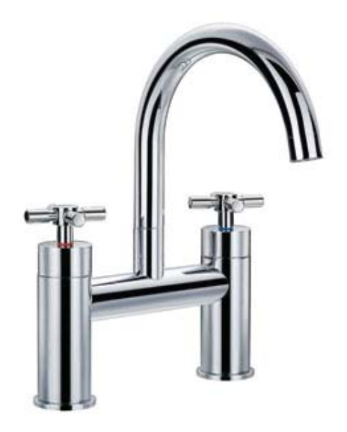
Deck Mount Modern Faucet with Goose Neck