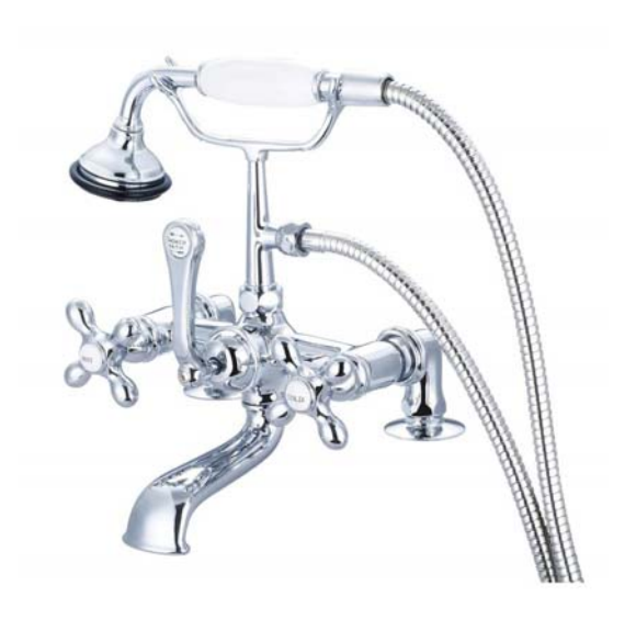
Deck Mount British Telephone Faucet with 2" riser

CLT-3201 / Chrome CLT-3204 / Brushed Nickel