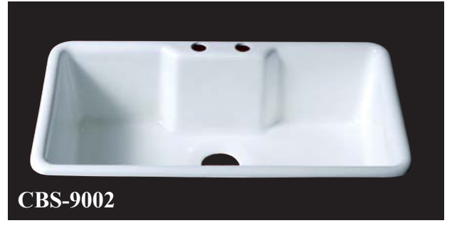
Dimensions: 32-1/4" L x 18-7/8" W x 8-7/8" H