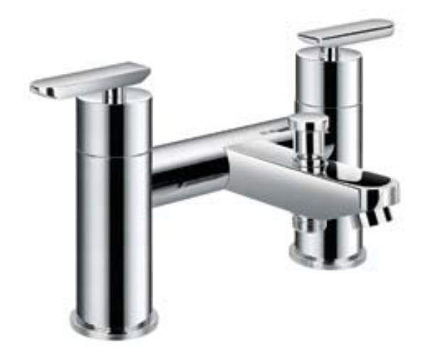
Deck Mount Modern Faucet

RS-71201 / Chrome RS-71203 / Polished Brass RS-71204 / Brushed Nickel RS-71201 / Polished Nickel RS-71206 / Oil Rubbed Bronze