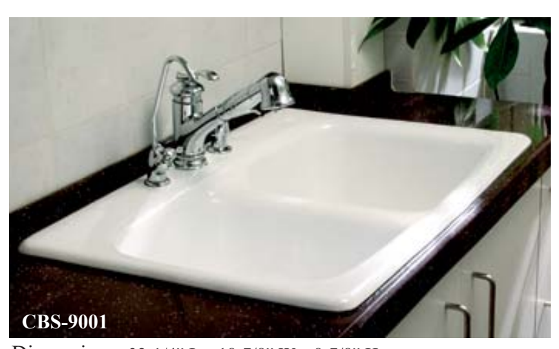
Dimensions: 32-1/4" L x 18-7/8" W x 8-7/8" H