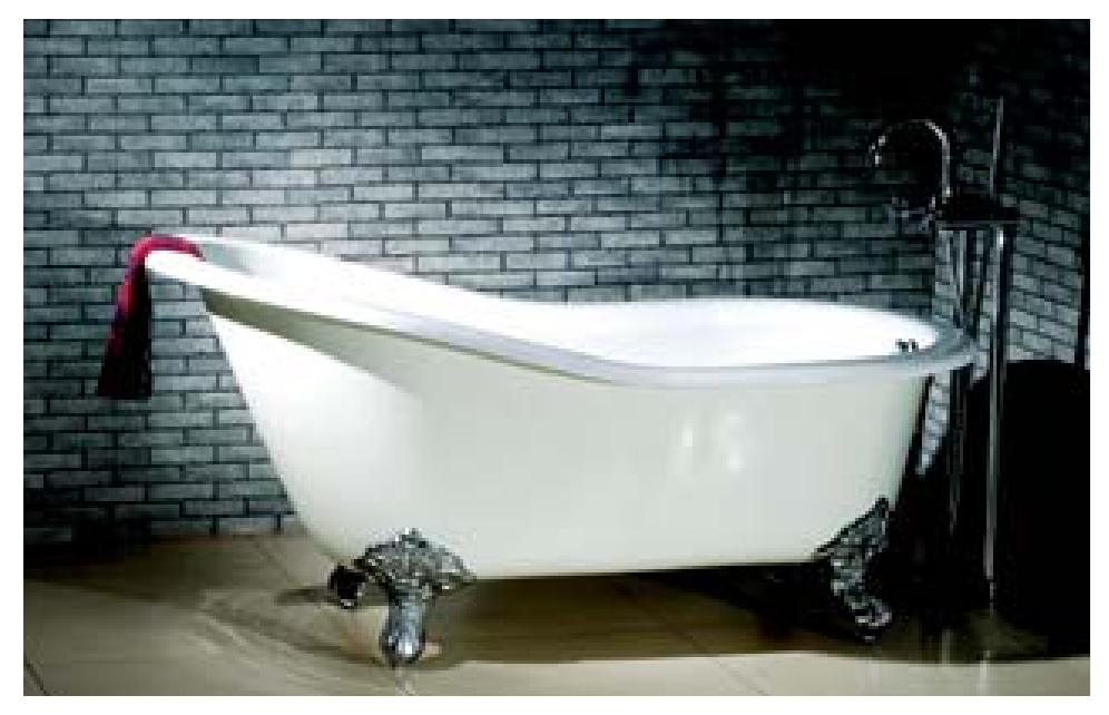
Right: SL610-IBCH 61" Cast Iron Slipper tub with no tap holes and Chrome Imperial Feet

61" Cast Iron Slipper tub with 7" Rim Holes and Brushed Nickel Ball-and-Claw Feet