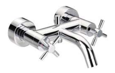
Wall Mount Modern Faucet