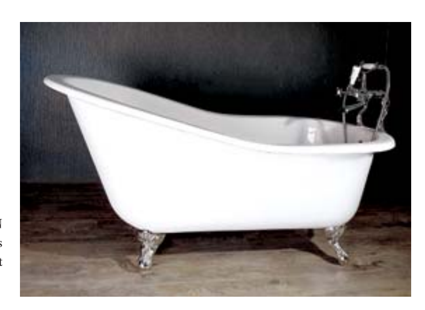
Right: SLF671-BBBN 67" Cast Iron Slipper tub with 7" rim holes and Brushed Nickel Ball-and-Claw Feet

67" Cast Iron Slipper tub with 7" rim holes and Oil Rubbed Bronze Imperial Feet, Custom Paint exterior