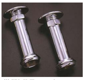
6" Wall Extension