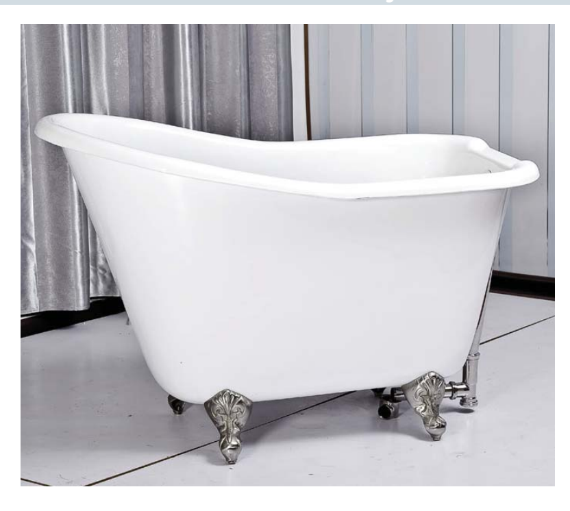
Right: SLN510-BBCH 51" Cast Iron Slipper tub with continuous rim and Chrome Ball-and-Claw Feet