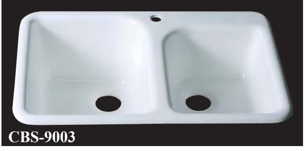
Dimensions: 32-1/4" L x 18-7/8" W x 8-7/8" H