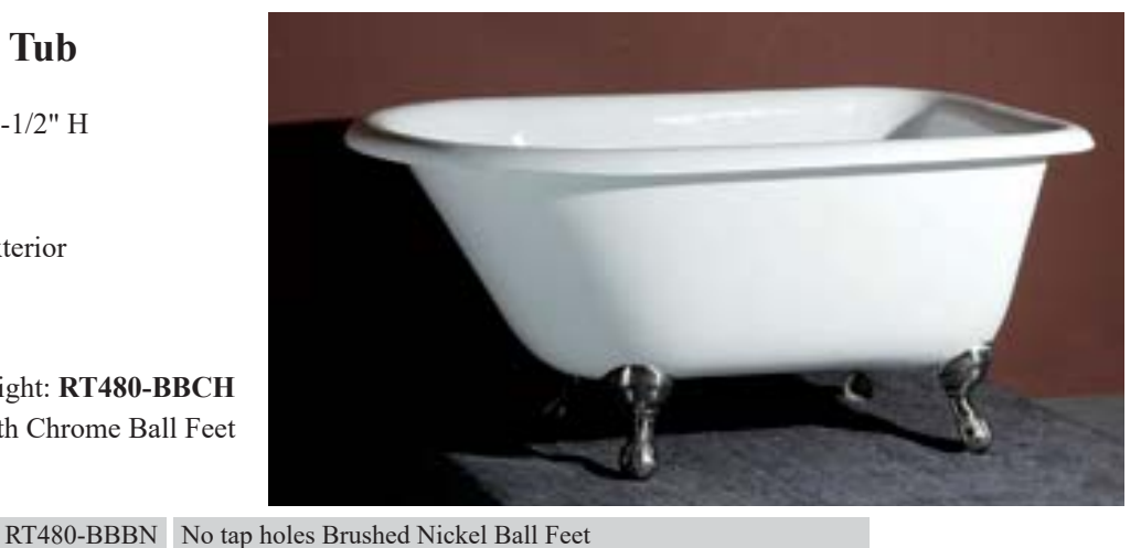
Right: RT480-BBCH 48" Roll Top tub with Chrome Ball Feet