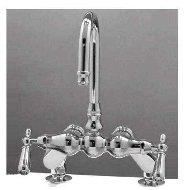
Deck Mount Faucet with Goose Neck

RS-71201 / Chrome RS-71203 / Polished Brass RS-71204 / Brushed Nickel RS-71201 / Polished Nickel RS-71206 / Oil Rubbed Bronze